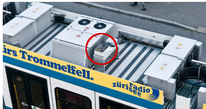
(b) Sensor node on top of a public transport vehicle in Zurich.

Figure 1: WiFi routers deployed on top of public transport vehicles can be used to estimate the occupancy rate of public transport vehicles.